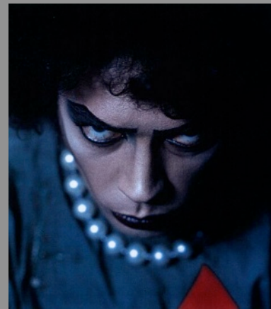
Rocky Horror Picture Show