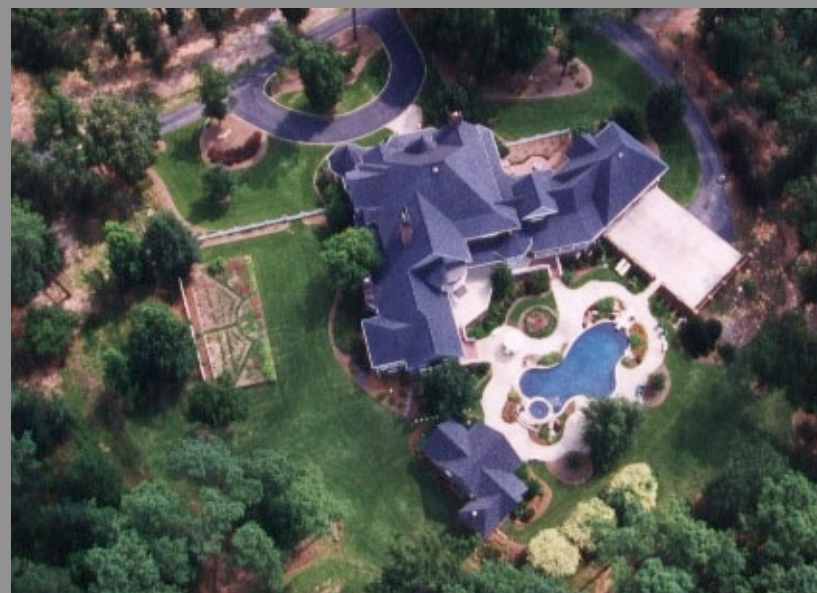
Beverly Hills Girl Scouts