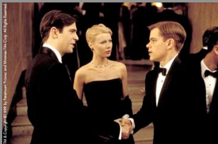
The Talented Mr. Ripley