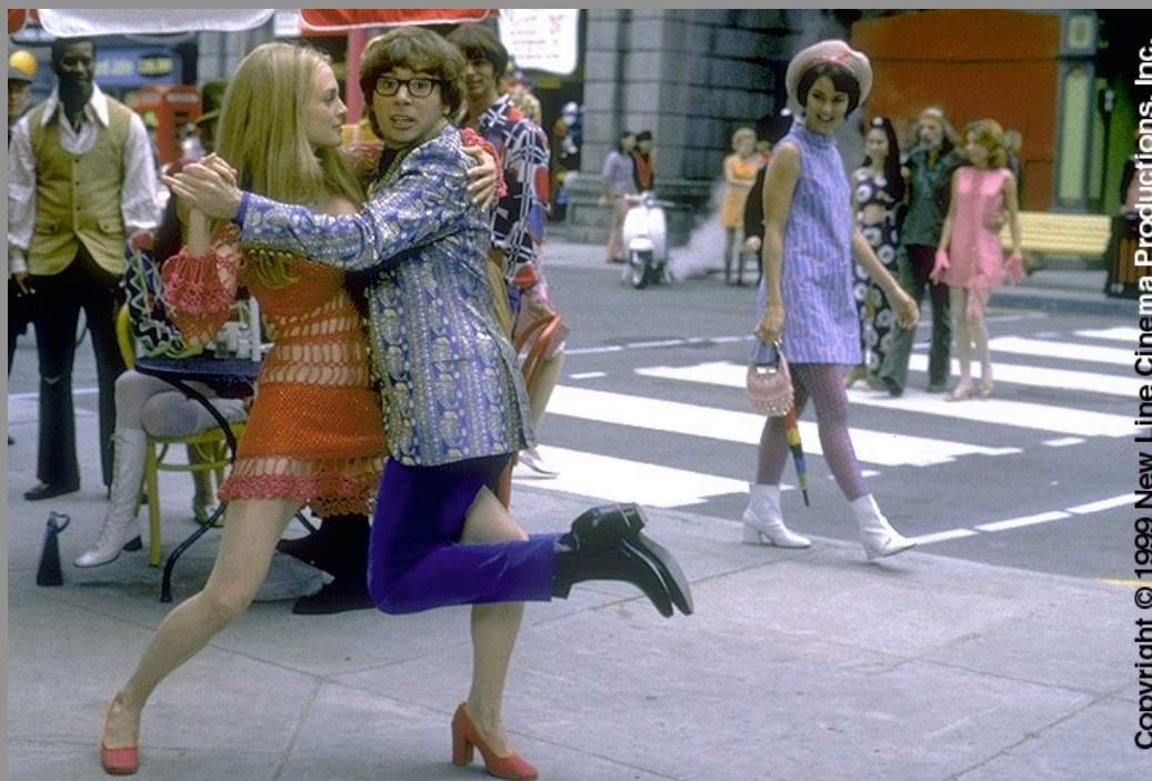
Austin Powers and the Spy Who Shagged Me