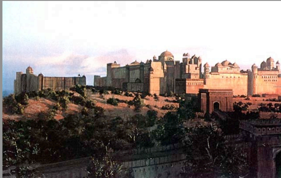
Indiana Jones And The Temple Of Doom